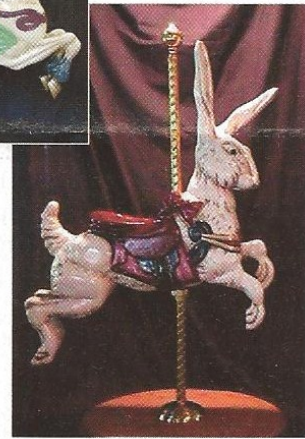
The rabbit above is carved in the manner of the Dentzel Carousel Factory, circa 1900.