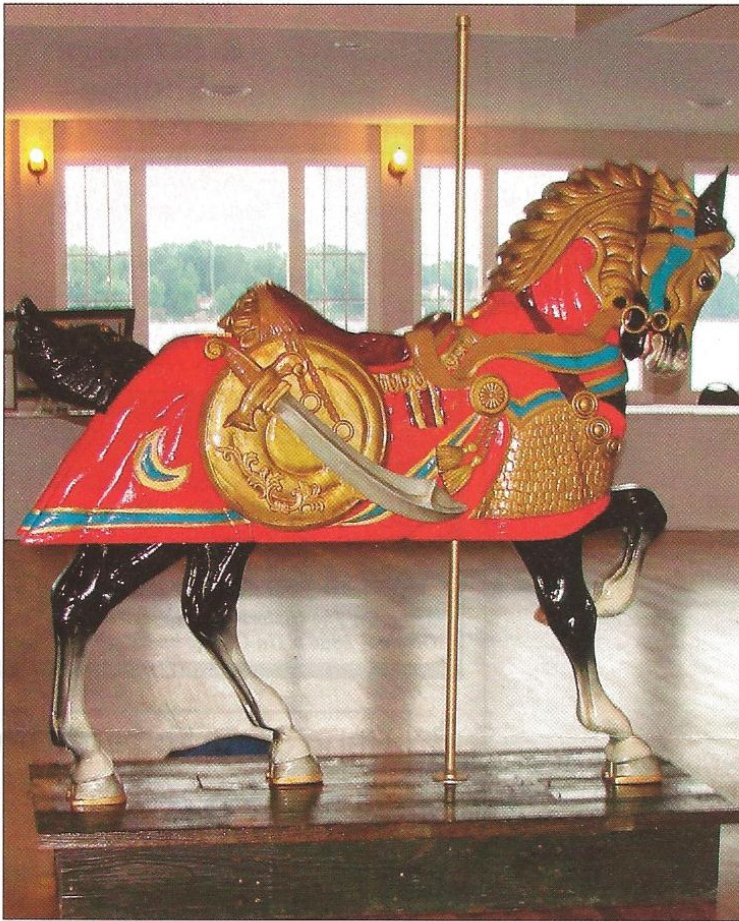
The Black Armoured Horse is a replica of the original lead horse on the Conneaut Lake Park Carousel and the centerpiece of the traveling exhibit.