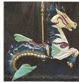
The seahorse at left is an original design based on the Hippocampus from Greek mythology.